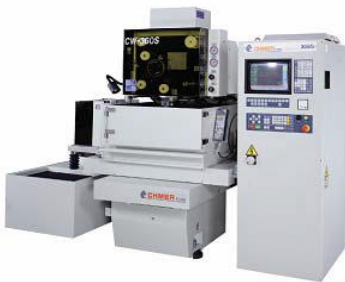
Fig 1. Wire Electric Discharge Machining

For this experiment the whole work can be down by Wire Electric Discharge Machining, model Electronica EZEECUT-WEDM with servo-head (constant gap) and positive polarity for electrode was used to conduct the experiments. Distil water as a dielectric fluid, with side flushing of copper tool. Experiments were conducted with positive polarity of electrode.