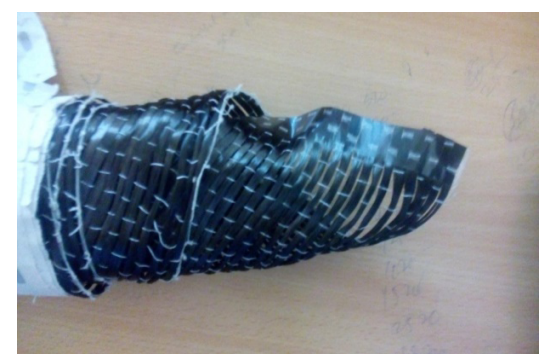
Figure1 Carbon Fiber Cloth Sample Piece of Tensile Test

CFRP sample piece is obtained according to the standard dimensions i.e. the sample pieces have a total length of 165 mm where gauge length is57 mm and width of 19 mm. Clamping section on either side have length of 45mm. The thickness of the sample piece is 5 mm. The radius of curvature between clamping section and gauge section is 76mm. later the sample piece is given proper finishing.