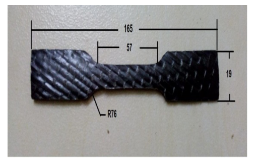
Figure 2: Sample Piece for Tensile Test (All dimensions are in mm)