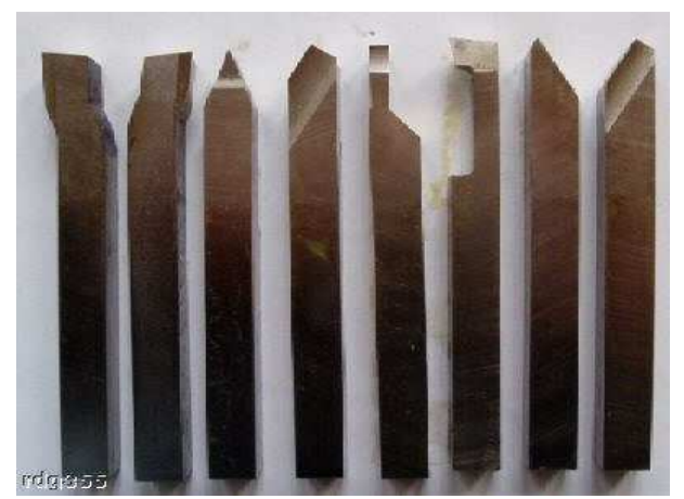
Fig. 1 HSS cutting tools

Parameterization A roughness value can either be calculated on a profile or on a surface. The profile roughness parameter (Ra, Rq,...) are