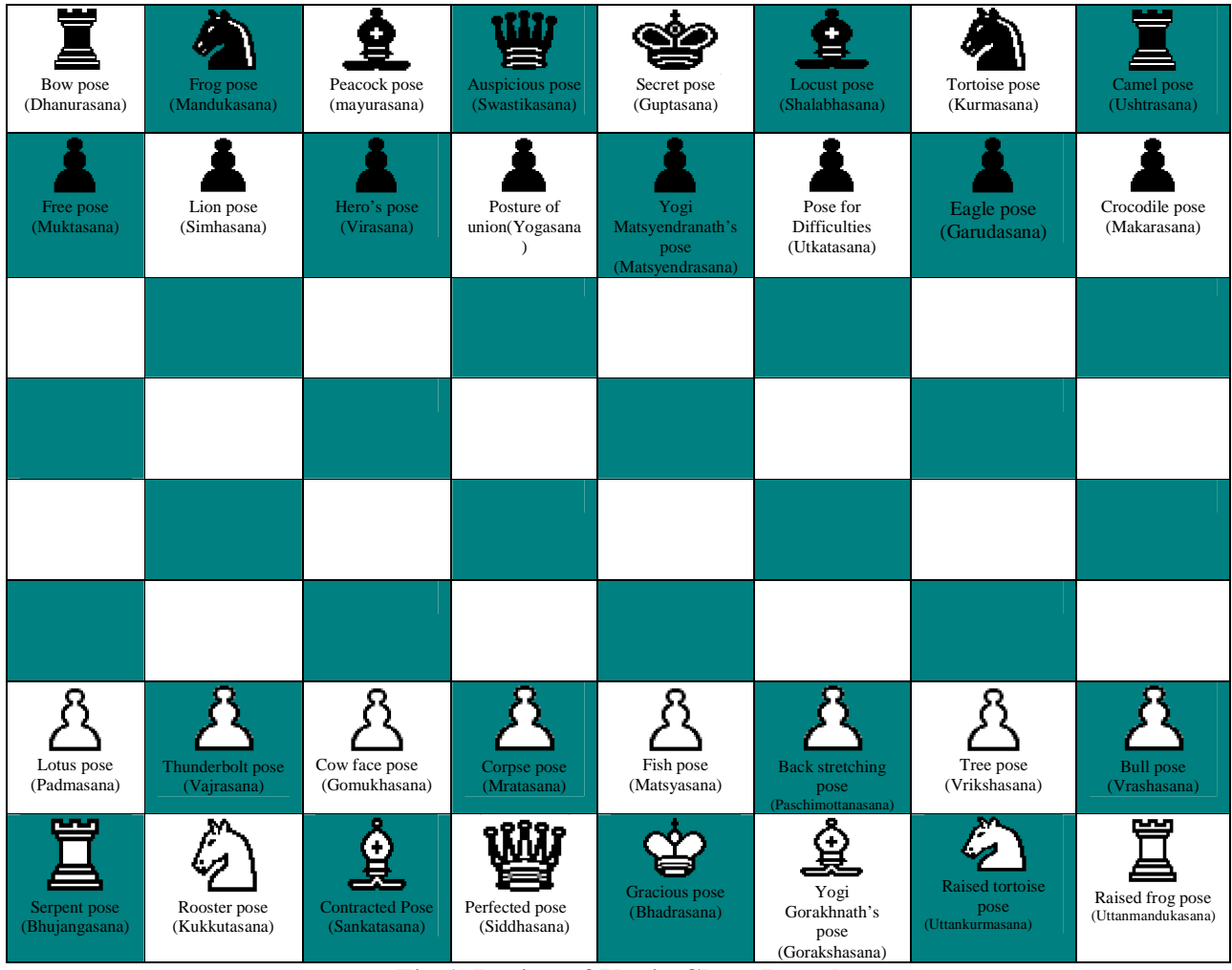
Fig.1. Design of Yogic Chess Board

Face validity: Based on the respondent's views and impressions, we have selected a sample size of 300 out of 630 subjects. In the beginning, the students were not serious enough to answer the questions. When explained about the objectives