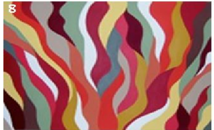
Figure 8: “Funky Fire” demonstrates a surrealistic fire giving an impression of a terrible combustion.