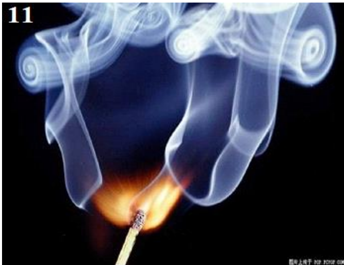
Figure 11: an interesting surrealistic folding fire is presented where our demonstrations are terminated by the impressive artwork of Magritte entitled “The Gradation of Fire”.

In conclusion the authors believe that the artistic demonstrations of combustion gives to this phenomenon a wider view and it becomes more attractive to the viewer.