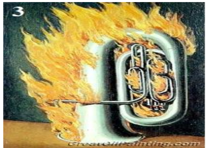
Figure 3: "The Discovery of Fire" and Fig.4 (right-hand-side) entitled "Portrait of Edward James".

The Belgium surrealist artist Rene Magritte (1898-1967) painted.