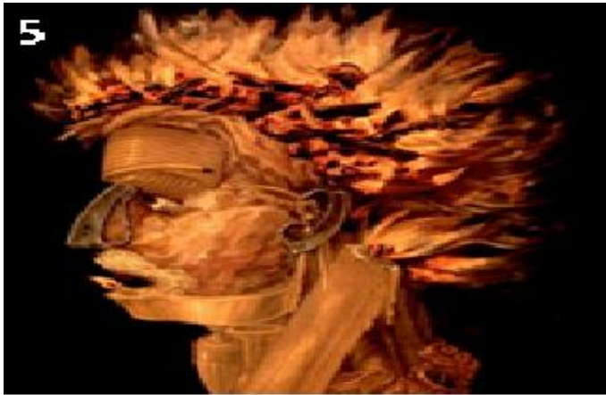
Figure 5: Surrealistic artwork, “The Fire”, painted by Giuseppe Arcimboldo (c.1530-1593), Mannerism Italian painter.