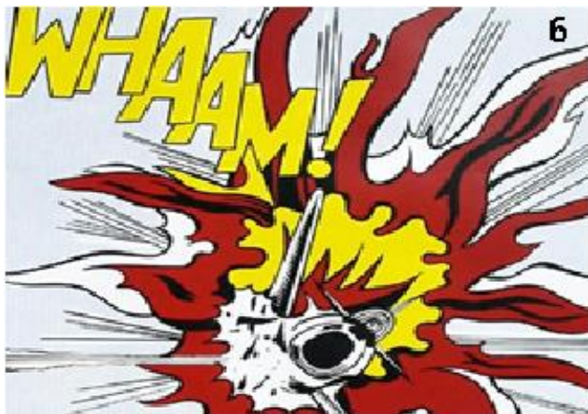
Figure 6: “Whaaam” demonstrates combustion due to firing of the enemy by an aircraft.

Roy Lichtenstein (1923-1997), an American pop artist, painted it. Rudolph Ackerman (1764-1834) an Anglo-German bookseller, inventor and lithographer painted.