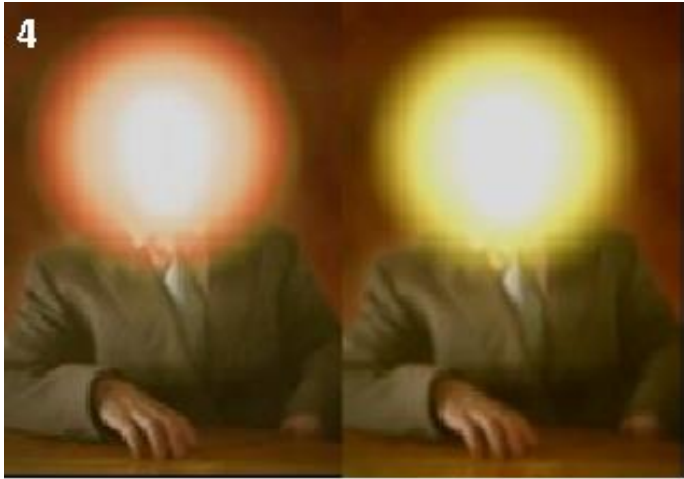
Figure 4: In order to emphasize the effect of combustion in artwork the authors changed the color from yellow to red in (left-hand-side).