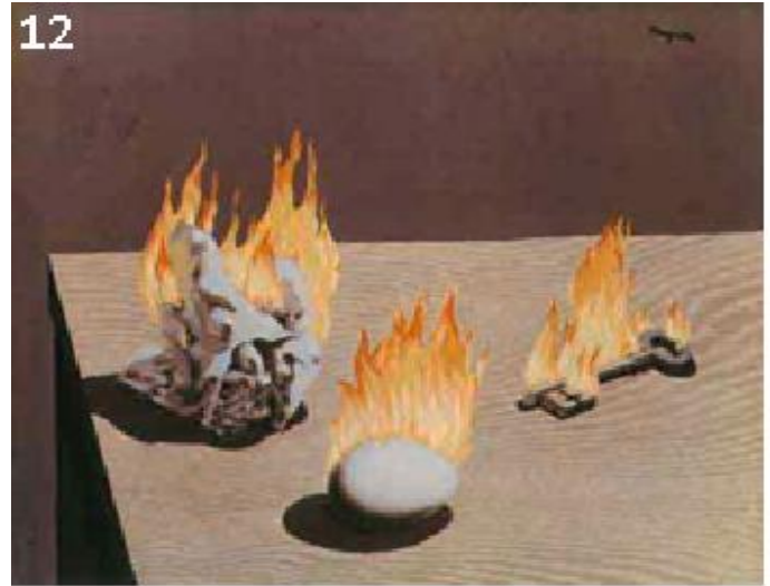
Figure 12: Combustion.

In conclusion the authors believe that the artistic demonstrations of combustion gives to this phenomenon a wider view and it becomes more attractive to the viewer.