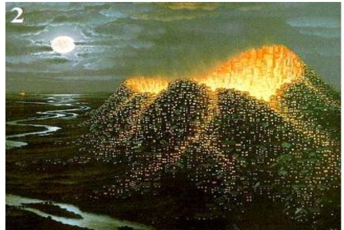
Figure 2: "Eruption" that demonstrates combustion inside a big hole of a mountain.

The regular burner and its flame are shown on the top of the figure. Due to the arrangement of the holes in the burner that are turning outside, the flame is also turning outside. In 1990 the first author developed an efficient gas burner in which the holes are turning to the center of the burner and are located