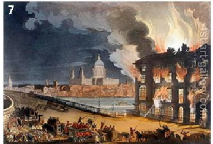
Figure 7: “Fire in London”

Roy Lichtenstein (1923-1997), an American pop artist, painted it. Rudolph Ackerman (1764-1834) an Anglo-German bookseller, inventor and lithographer painted.