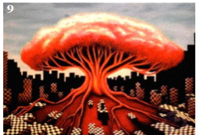
Figure 9: A surrealistic “Atomic Bomb Tree” artwork associated with fire.