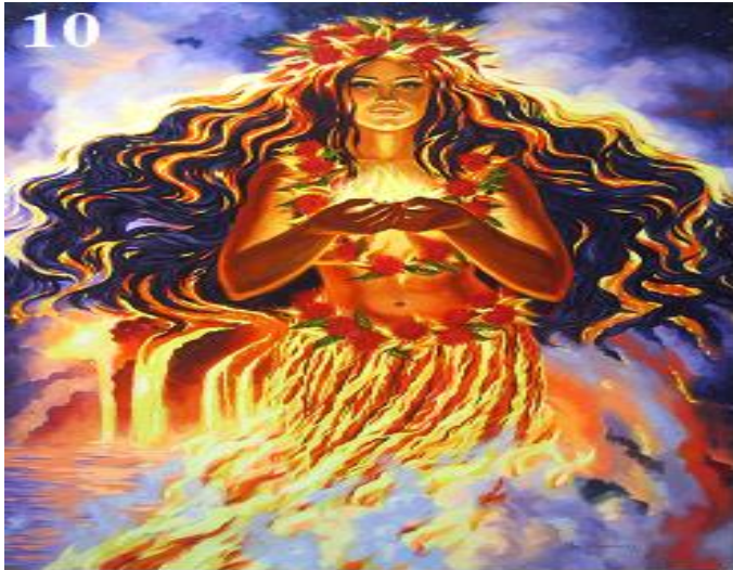
Figure 10: is another surrealistic artwork of fire entitled “Sacred Fire of Pele, Goddess of Hawaii Volcano” that is located in the Hawaiian Art Gallery by Olga Schevchenko.