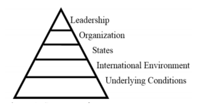
Figure 2: Structure of terror.

Despite their diversity in motive, sophistication, and strength, terrorist organizations share basic structure as depicted in figure 2. This is also referred to as the hierarchical structure of terrorist organization and the conditions for terrorists to take form which occurs sequentially.